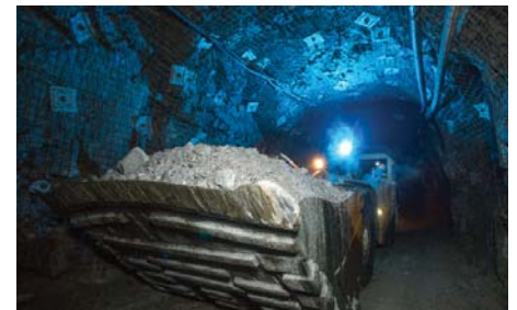
Enables tele-operation of an LHD between shifts and autonomous control from the muck pile to the ore pass