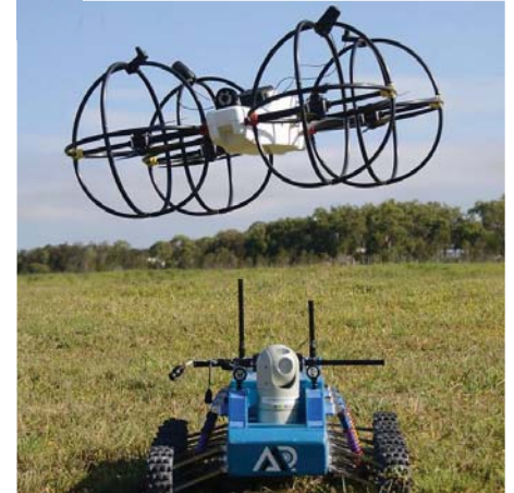
Australian Droid + Robot's Explora droids for underground inspections has Rajant's BreadCrumb technology integrated

An example is the Explora underground mapping and inspection robot by Australian Droid + Robot, which has Rajant's BreadCrumb technology onboard—enabling its ability to independently perform visual inspections, thermal imaging, laser survey scanning, gas sensing, and other tasks to identify and or operate in hazardous mine conditions. Rajant's network also uniquely enables these autonomous systems to communicate vehicle to vehicle to create an autonomous mesh network to manage their movements throughout the mine.