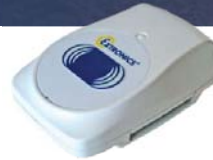
Extronics AeroScout Wi-Fi-based RFID tags are supported by Rajant's network

Rajant has partnered with Extronics to support its AeroScout Wi-Fi-based active RFID tags for personnel and asset tracking. Because Rajant's network never breaks for handoff, tracking of personnel and assets is highly reliable and can also be used to identify productivity bottlenecks in real-time to improve operational efficiency.